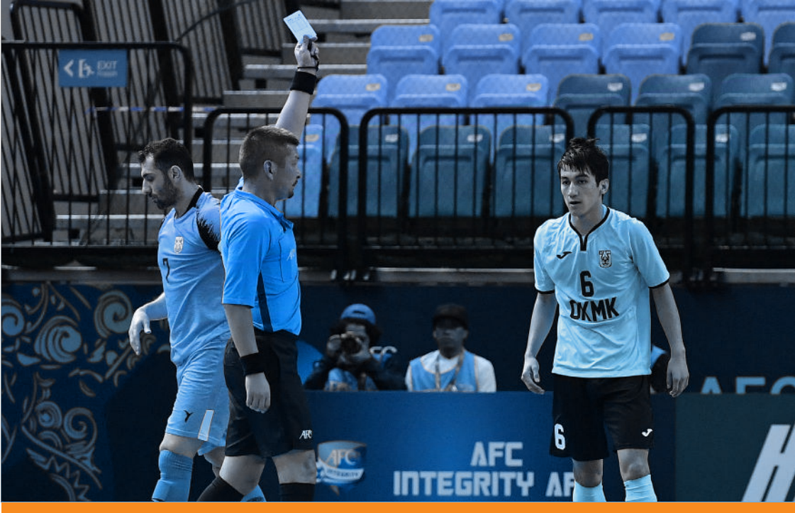
B. Sending-off Offences - Reasons to Show a Red Card