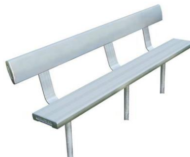
Bench Seat With Backrest In-Ground $575.00 – $998.00 ex. GST FELIGB2 / FELIGB3 / FELIGB4 Above Ground $586.00 – $1,031.00 ex. GST FELAGB2 / FELAGB3 / FELAGB4