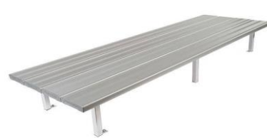
Quad Plank Seating $1,335.00 – $2,670.00 ex. GST FELGCR18 / FELGCR19 / FELGCR20