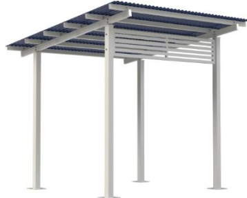
3x3 Aluminium Skillion Shelter $6,380.00 ex. GST FELASS33