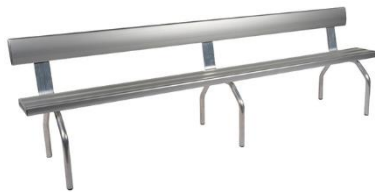
Free Standing Bench Seat With Back Rest $575.00 – $1,031.00 ex. GST PSFSB2 / PSFSB3 / PSFSB4