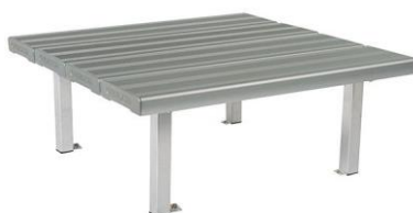
Platform Seating $977.00 ex. GST BRPFS