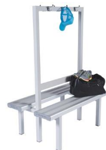
Double Sided Combo $1,628.00 ex. GST GHDS18

VIEW THE ENTIRE SHELTER, SEATING & GRANDSTANDS RANGE