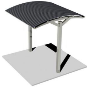
BBQ Shelter $4,340.00 ex. GST FELSPSH