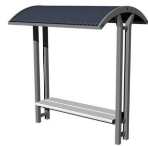
Double Bench Shelter $3,147.00 ex. GST FELDBSH