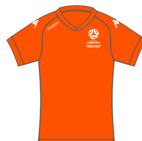
GOALKEEPERS (ALL REGIONS)