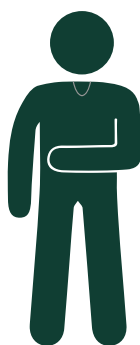
TACKLE FROM BEHIND