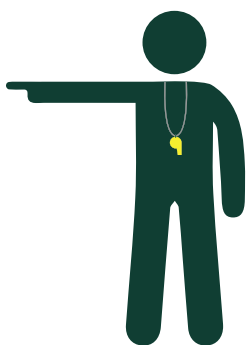
SIX SECOND COUNT