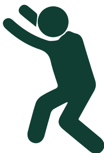
MAIN ADVANTAGE 2