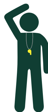
EXCEEDING HEAD HEIGHT