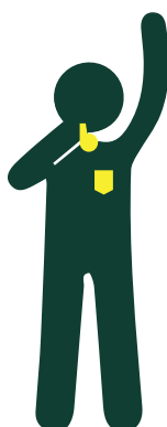
INDIRECT FREE KICK